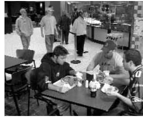
The new Food Court in the Campus Center

The College unveiled its renovated "Campus Living Room" in 2004. The major enhancements to the Campus Center occurred in two phases over two years. Phase I included remodeling of the student dining facilities on the second floor to accommodate a new food station-style menu, a new bookstore, the addition of Java City Café, and a convenience store. Phase II involved renovation of facilities on the first floor including the dining area, the Rock Food Court, and the Bear's Den, making the facility the true center of campus social life.