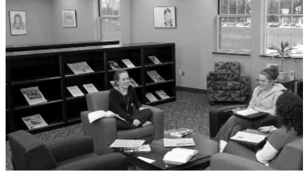
The new Clarke Reading Room in the D'Amour Library addition

Gifts-in-kind are a meaningful way to complement our intellectual resources and enhance the educational experience of our students.