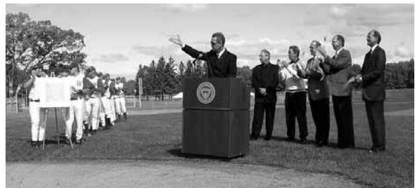
Dedicating the new George E. Trelease Memorial Baseball Park