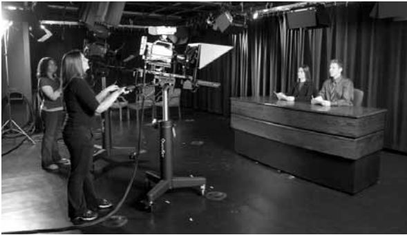
The new television studio in the D'Amour Library addition

The College has recently completed a 6,000 square foot, $1.9 million addition to the D'Amour Library. Many new technologies featured in this addition will elevate the quality of the educational experiences of not only our current students, but of students for generations to come. The new facilities feature a television studio and editing suites for producing videos, recording faculty interviews for regional and national media, and generating news feeds in our exclusive partnership with WAMC-FM National Public Radio.