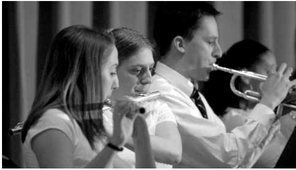
The Concert Band performs during the spring showcase concert.

The arts are important to us in profound and diverse ways. In creating art, we share with others the complexity of our inner selves, revealing the richness of our spirit. At Western New England College, we support opportunities for students to develop in this special way.