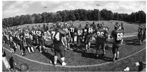
Golden Bear Multipurpose Turf Stadium

This multipurpose athletic field is a major step toward fulfilling our vision for athletics. It provides opportunities to support our students and propel both our athletics program and the College to the next level of excellence. Opened in September 2003, this lighted multipurpose field is part of the Suprenant Field complex and is used by several of the College's varsity teams and by the intramural program. The stadium was built with the support of donations to the Golden Bear Club. The Golden Bear Club is a way for alumni and friends to keep in touch with the athletic programs here, and at the same time show appreciation for student-athletes. All memberships directly support athletics and allow our programs to thrive and continue to improve and grow.